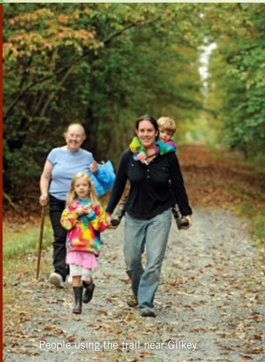
People using the trail near Gilkey