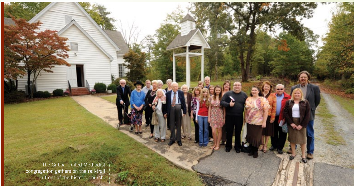
The Gilboa United Methodist congregation gathers on the rail-trail in front of the historic church.